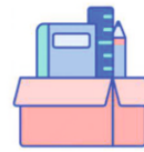
A structured environment with specially designed learning materials