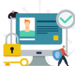
Cyber laws awareness programme