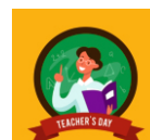
Celebrating 131 days