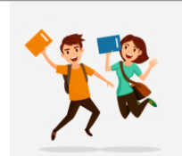
Burden Free Education