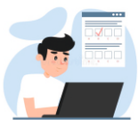
Computer language examination