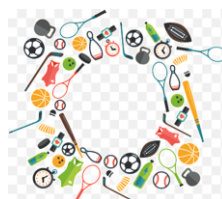
Indoor / Outdoor Sports