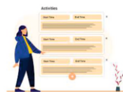
Daily work sheet